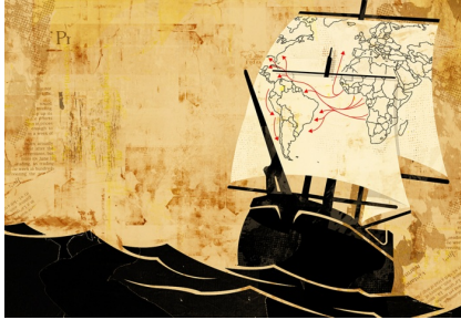
Teaching Hard History: Grades K-5

what they are reading and seeing. That said, before committing to teach these lessons, taking advantage of the background information and guiding videos is essential. Teaching "hard history" requires significant preparation. In all cases, you will have to review the recommended developmentally appropriate topics and decide whether and/or how to incorporate them into your existing curriculum activities. You should not hesitate to be selective, especially as you do this for the first time and feel your way around this potentially sensitive experience. As an example, the guidelines suggest that students in Grade 2 will be learning about the civil war and slavery's relationship to it. This may not be in your current historical scope and sequence for Grade 2, and so you might defer the relevant lessons to the grade level in which you do spend meaningful time on the civil war and thereby can put the slavery discussion into a sustained context.