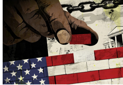
Teaching Hard History: Grades 6-12